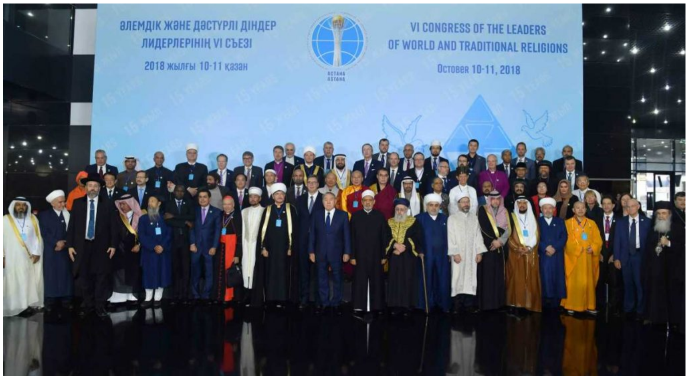
The 6 th convention of world and traditional religions.

However, Astana tries to hold itself out as a centre of religious tolerance and since 2003 it regularly holds conventions of the leaders of world and traditional religions. As the name can suggest, religions that are not recognised in Kazakhstan don't take part in the event. Yet another convention was held in Astana last year.