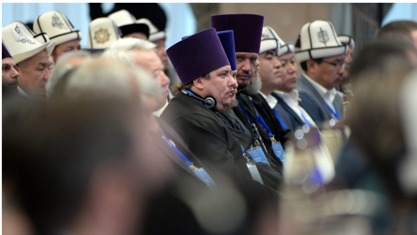
The "Orthodoxy and Islam - the religions of the world" international conference held on November 21, 2019, in Bishkek.

It should be noted that recent events in religion-state relations demonstrate the direction of state policy taken on the implementation of this particular model (National Development Strategy of the Kyrgyz Republic for 2018-2040). Nevertheless, we should not forget that independent Kyrgyzstan has witnessed several changes in the policy in this area, which indicates its variability and unpredictability.