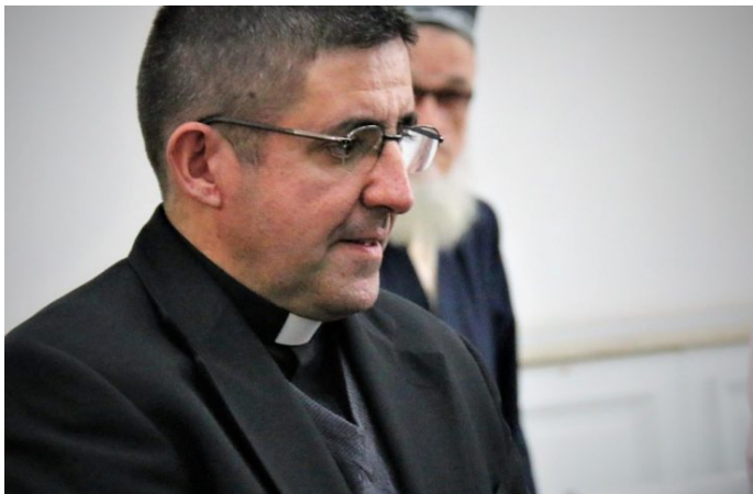
Pedro Rodriguez.

The church is currently closed for public services. Also, all activities for provision of social assistance to the parishioners have been temporarily suspended.